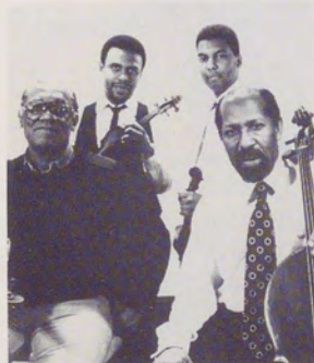
Heritage String Quartet