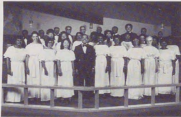
Our Own Thing Chorale