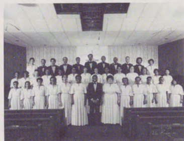
Clarence Smith Community Chorus