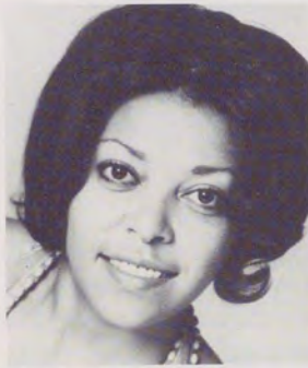
Dorothy Rudd Moore